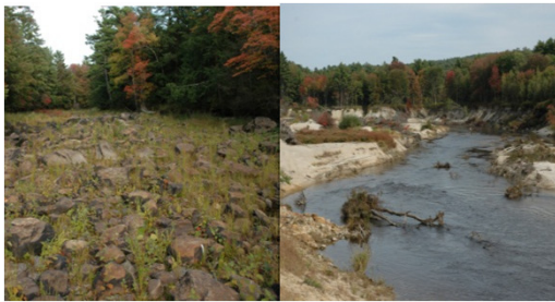
Figure 2. The abandoned channel (left) formerly habitat for A. varicosa and the unstable new channel (right).

Approximately 600 resident mussels were tagged per site in 2006 (Table 1). Although roughly equal numbers of mussels were translocated to Sites 1 and 2, data recording errors prevented some tags from being tracked. As a result, the number of translocated mussels whose tags could be tracked varied by site (Table 1). The recapture rate was highest among resident mussels in the Control site and lowest at Site 2.