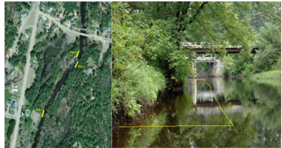
Figure 3. Aerial view of translocation sites 1-3 showing the extent of riparian vegetation including food plain forest. Upstream view of the plot at site 1.

A comparison of length frequencies among relocated and resident mussels reveals that the relocated mussels were somewhat larger than the resident mussels (Figure 1, Table 1; k-s = 0.20 , P < 0.0001 ). The median relocated mussel was 47 mm (42 to 52 mm for 25 th to 75 th percentile; n = 772 ), and the median resident mussel was 44 mm (40 to 48 mm for 25 th to 75 th percentile; n = 2929 ).