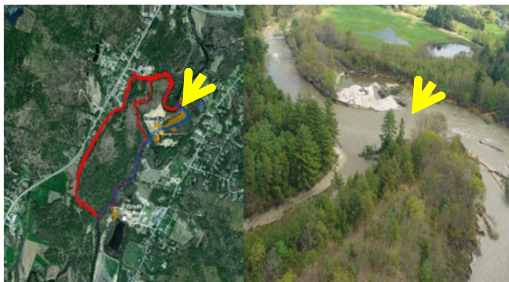
Figure 1. Aerial view of the avulsed Suncook River on May 17, 2006. The left photo shows the abandoned channel in red and the new channel in blue. In the right photo flow is from the parent channel (top left) to the new channel (lower right). The yellow arrows show the nick point of the avulsion.

Objectives: (1) determine whether the recapture rates differed between resident and translocated mussels, (2) determine whether recapture rates differed among sites, (3) evaluate sample size (number of tagged mussels per year) to ensure sufficient power to detect the effect of translocation on survival and sufficient precision for estimation of survival.