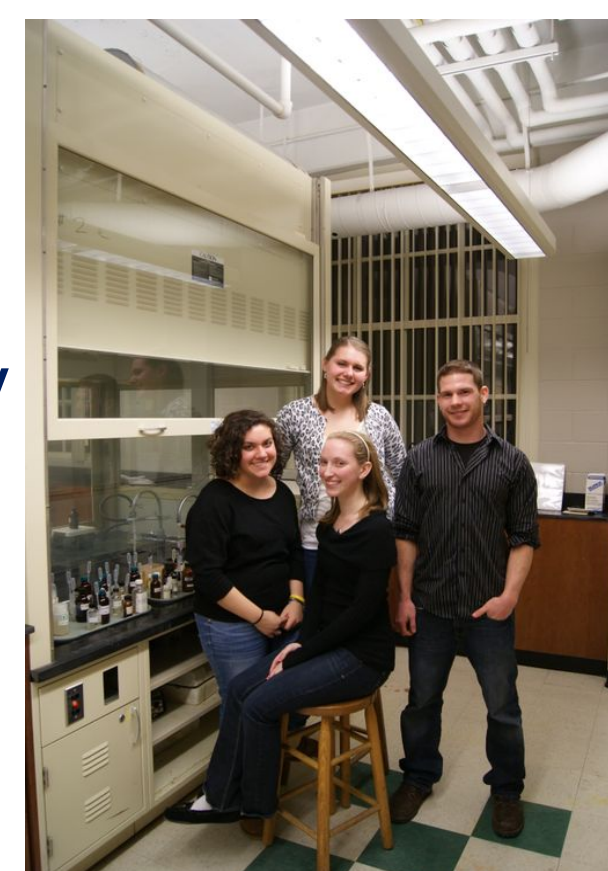
2011-2012 Club Officers