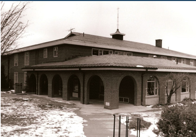
Geisel Library, circa late 1980's